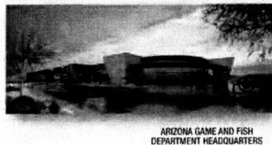
ARIZONA GAME AND FISH DEPARTMENT HEADQUARTERS